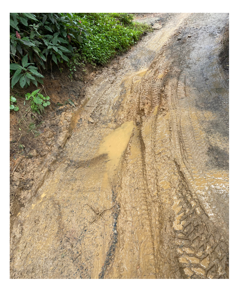
Photos showing rain damage on Scotland Island Roads