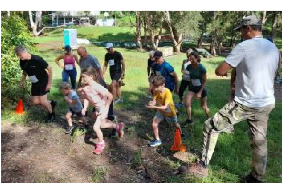
The Island Race 2022: participants take off.