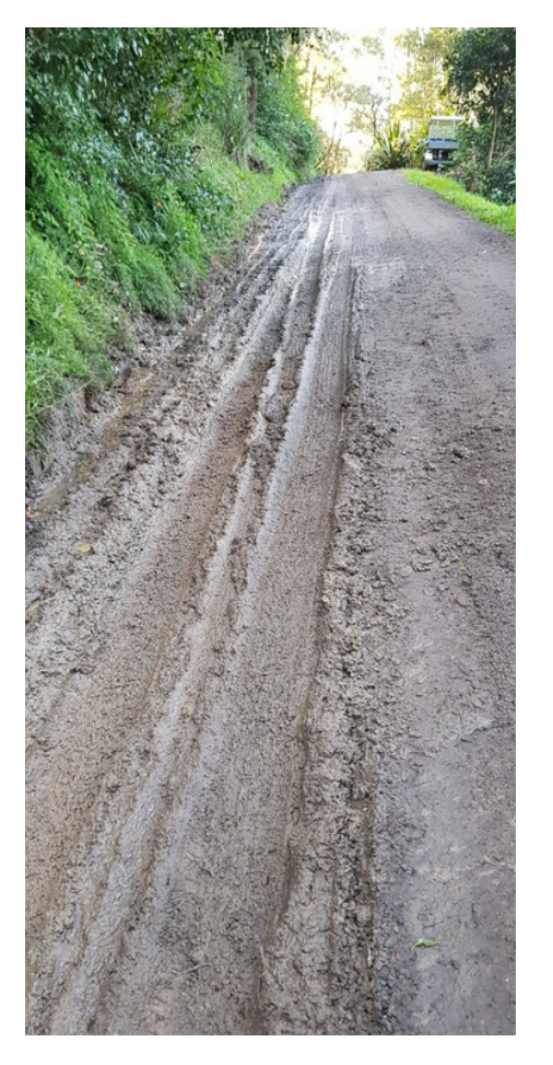
Thompson Street